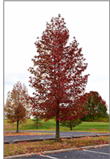
Happidaze Sweet Gum in fall