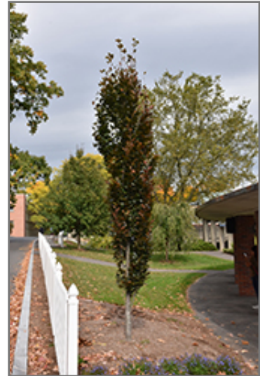
Dawyck Purple Beech