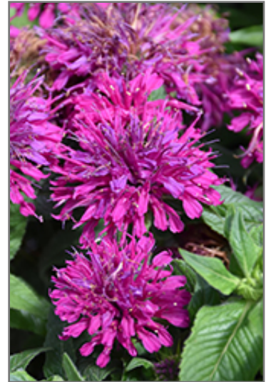
Grape Gumball Beebalm flowers

This variety forms a dense mound of purplish-pink flowers on well branched, strong stems, over lush dark green foliage that has an excellent resistance to powdery mildew; great for massing along borders