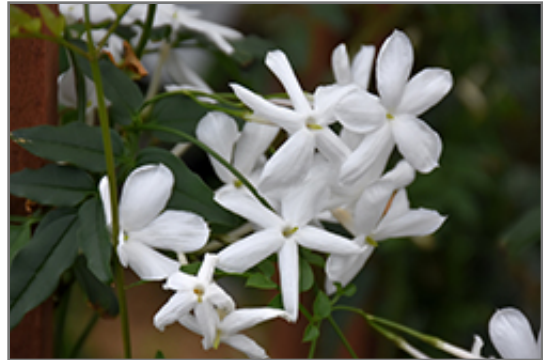
Climbing Jasmine flowers

This is a dense multi-stemmed evergreen houseplant with a spreading, ground-hugging habit of growth. This plant may benefit from an occasional pruning to look its best.