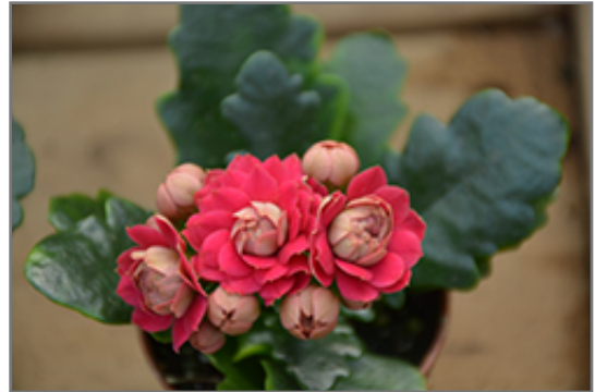
Calandiva Red Kalanchoe flowers