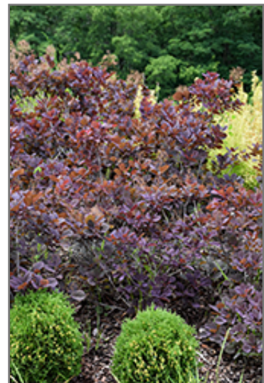
Velveteeny Purple Smokebush