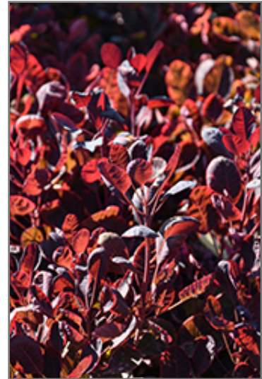
Velveteeny Purple Smokebush foliage

Velveteeny Purple Smokebush makes a fine choice for the outdoor landscape, but it is also well-suited for use in outdoor pots and containers. With its upright habit of growth, it is best suited for use as a 'thriller' in the 'spiller-thriller-filler' container combination; plant it near the center of the pot, surrounded by smaller plants and those that spill over the edges. It is even sizeable enough that it can be grown alone in a suitable container. Note that when grown in a container, it may not perform exactly as indicated on the tag - this is to be expected. Also note that when growing plants in outdoor containers and baskets, they may require more frequent waterings than they would in the yard or garden.