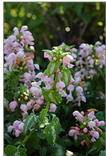
Shell Pink Spotted Dead Nettle flowers