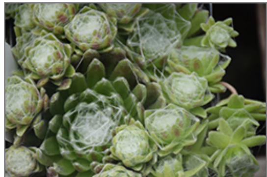
Cobweb Buttons Hens And Chicks