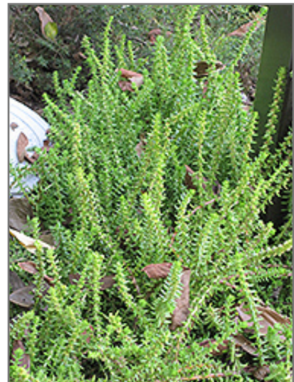
Watch Chain Crassula