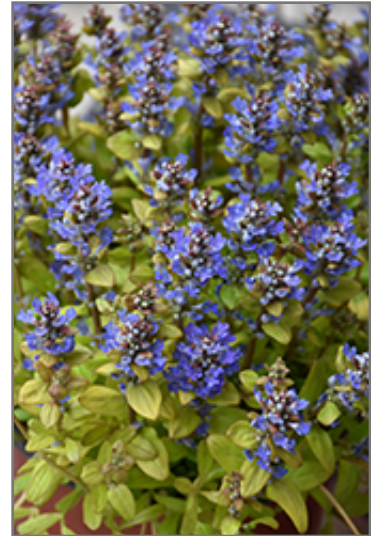
Feathered Friends Fancy Finch Bugleweed flowers

This plant will require occasional maintenance and upkeep, and should not require much pruning, except when necessary, such as to remove dieback. It is a good choice for attracting butterflies to your yard, but is not particularly attractive to deer who tend to leave it alone in favor of tastier treats. Gardeners should be aware of the following characteristic(s) that may warrant special consideration;