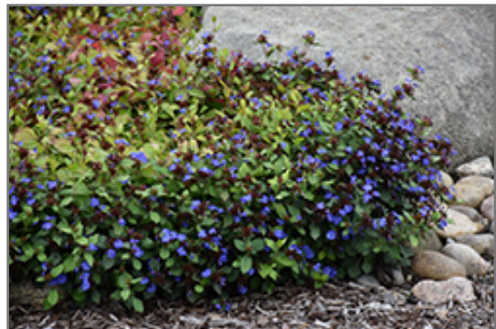
Plumbago in bloom