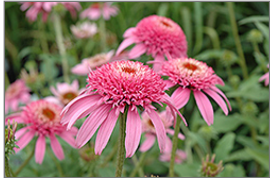
Cone-fections Pink Double Delight Coneflower flowers

Cone-fections Pink Double Delight Coneflower is recommended for the following landscape applications;