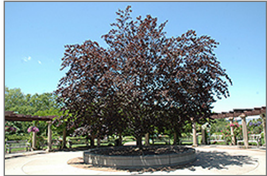
Purple Beech