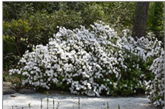
Delaware Valley White Azalea in bloom