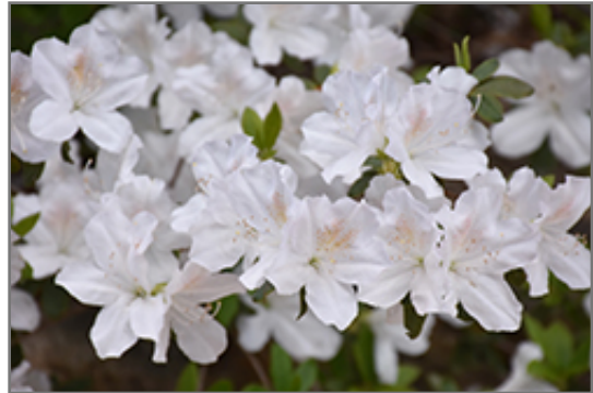
Delaware Valley White Azalea flowers