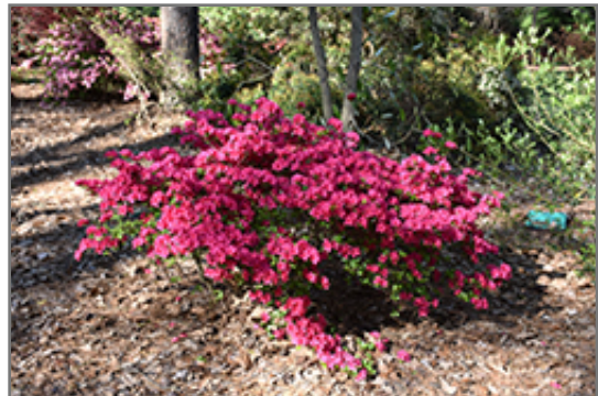
Girard's Fuchsia Evergreen Azalea in bloom