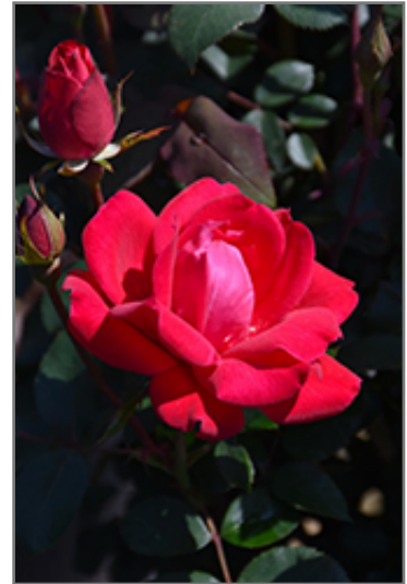
Double Knock Out Rose flowers

Double Knock Out Rose is recommended for the following landscape applications;