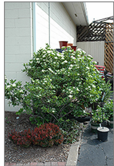
Winterthur Viburnum in bloom