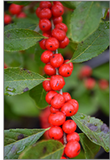
Red Sprite Winterberry fruit