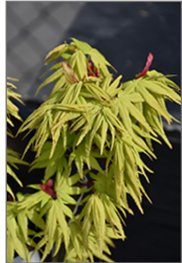
Mikawa Yatsubusa Japanese Maple foliage

Mikawa Yatsubusa Japanese Maple is recommended for the following landscape applications;