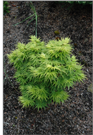
Mikawa Yatsubusa Japanese Maple

Mikawa Yatsubusa Japanese Maple is a fine choice for the yard, but it is also a good selection for planting in outdoor pots and containers. With its upright habit of growth, it is best suited for use as a 'thriller' in the 'spiller-thriller-filler' container combination; plant it near the center of the pot, surrounded by smaller plants and those that spill over the edges. It is even sizeable enough that it can be grown alone in a suitable container. Note that when grown in a container, it may not perform exactly as indicated on the tag - this is to be expected. Also note that when growing plants in outdoor containers and baskets, they may require more frequent waterings than they would in the yard or garden.