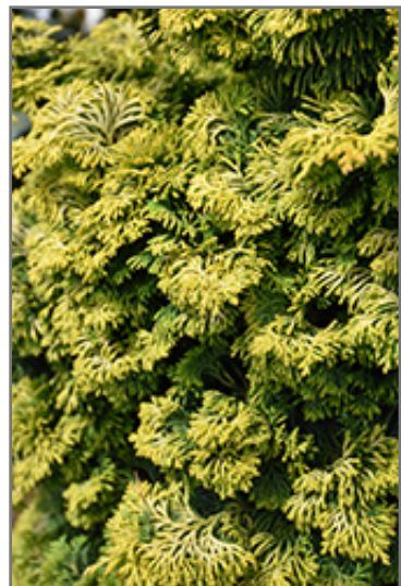
Dwarf Golden Hinoki Falsecypress foliage