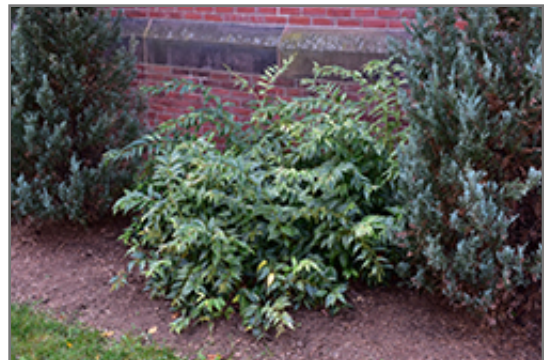
Rainbow Fetterbush