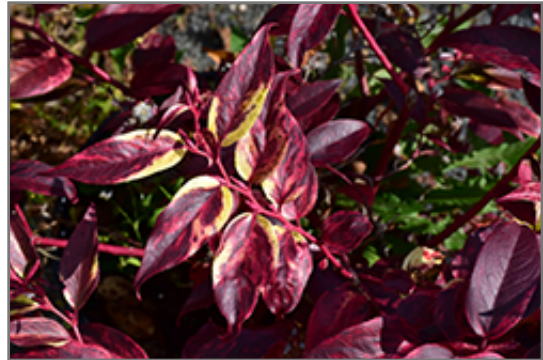
Rainbow Fetterbush in fall

Rainbow Fetterbush makes a fine choice for the outdoor landscape, but it is also well-suited for use in outdoor pots and containers. Because of its height, it is often used as a 'thriller' in the 'spiller-thriller-filler' container combination; plant it near the center of the pot, surrounded by smaller plants and those that spill over the edges. It is even sizeable enough that it can be grown alone in a suitable container. Note that when grown in a container, it may not perform exactly as indicated on the tag - this is to be expected. Also note that when growing plants in outdoor containers and baskets, they may require more frequent waterings than they would in the yard or garden.