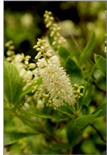
Summersweet flowers

Summersweet is recommended for the following landscape applications;