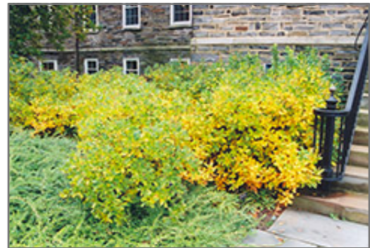
Summersweet in fall