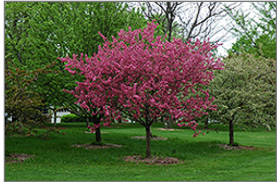
Prairifire Flowering Crab in bloom

This tree will require occasional maintenance and upkeep, and is best pruned in late winter once the threat of extreme cold has passed. It has no significant negative characteristics.