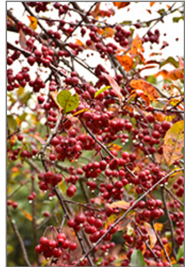
Prairifire Flowering Crab fruit

This tree should only be grown in full sunlight. It prefers to grow in average to moist conditions, and shouldn't be allowed to dry out. It is not particular as to soil type or pH. It is highly tolerant of urban pollution and will even thrive in inner city environments. This particular variety is an interspecific hybrid.